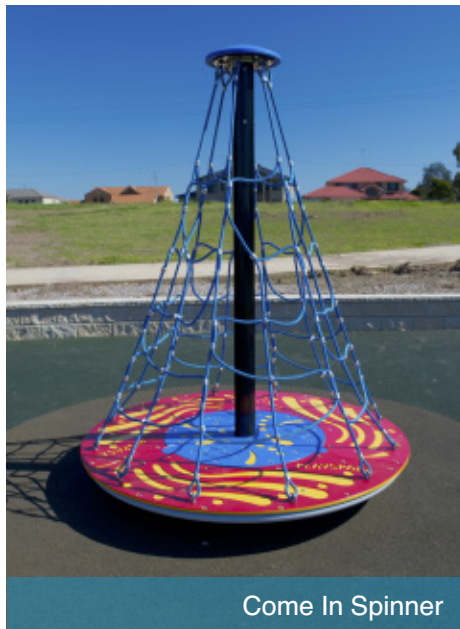
Come In Spinner