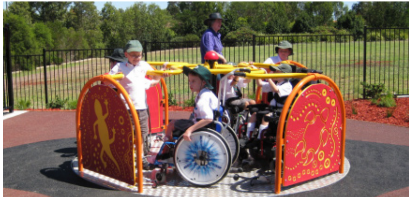
Access For All

To view our extensive range visit aspaceto.com.au or call 1800 632 222